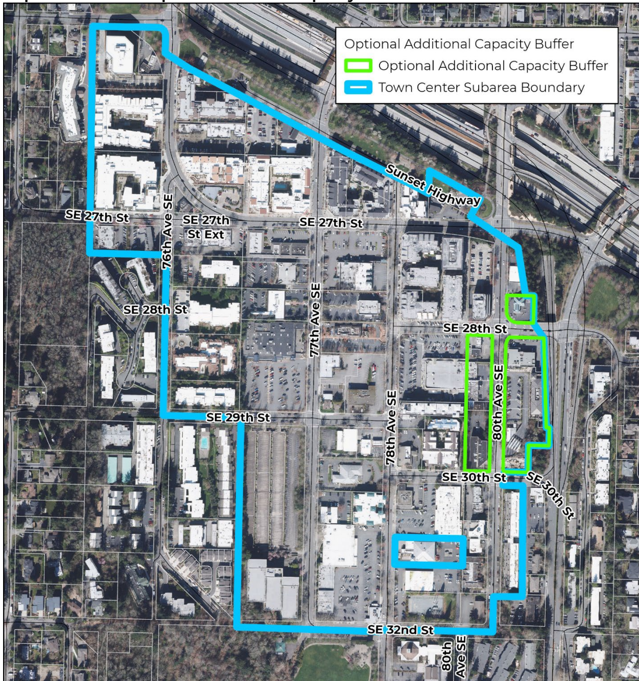
Map 4. Town Center Optional Additional Capacity Buffer.

Table 4 shows the capacity analysis for the Optional Additional Capacity Buffer study area. If the study area were rezoned to have a maximum building height of five stories, the estimated development capacity in this area would increase by 201 dwelling units. If this area were rezoned to a maximum building height of seven stories, the estimated development capacity would increase by 401 dwelling units. If this area were rezoned when the City develops its permanent regulations, this additional capacity would help demonstrate the City is making progress toward its Housing Element goals at the 5-year progress report.